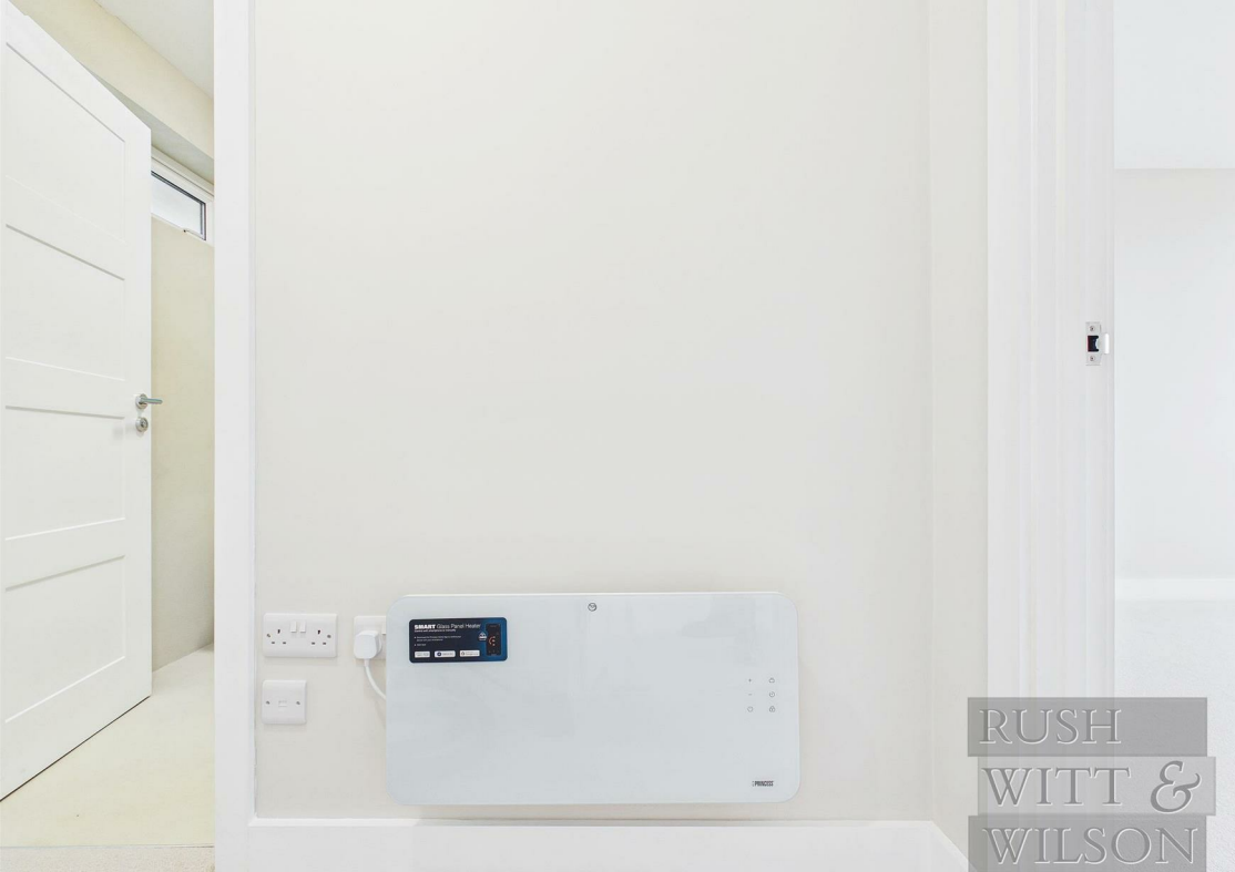
RUSH WITT & WILSON